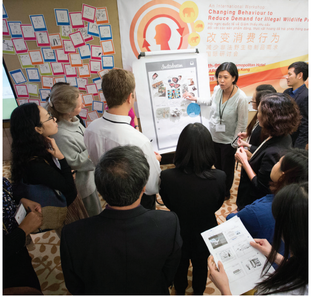
Changing Behaviour to Reduce Demand for Illegal Wildlife Products' workshop, Hong Kong, 7–9 March 2016.

Ultimately, these two forces combine to infer scarcity of raw material available to the market, whilst highlighting in a pervasive high-profile manner the threat of extinction to several species. Mass-media distribution of images of powerful animals, celebrating their majesty, highlighting their rarity, the dwindling supply of their products and appealing for empathy for their plight, is commonplace, but without consideration, from a behavioural science perspective, of the potential influence on the choices of wildlife consumers.