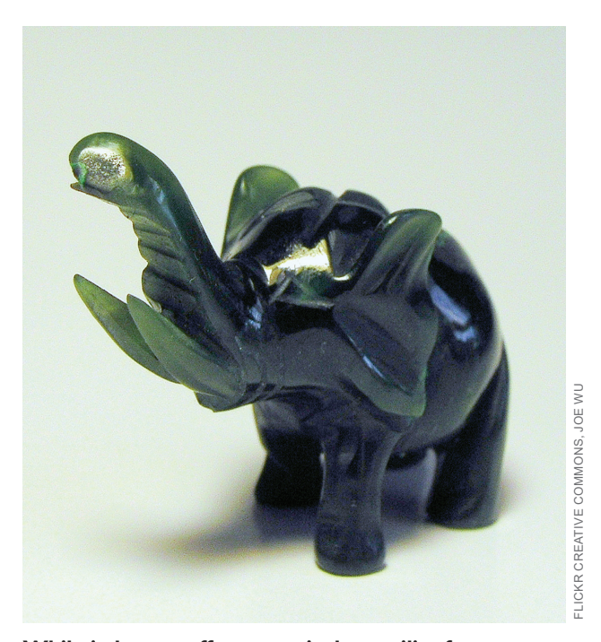
While jade may offer an equivalent utility for consumers to elephant ivory, it could not be marketed as a "suitable" alternative owing to alleged human rights abuses in the extraction industry.

More encouragingly, financial analysts have reported recently that the "super wealthy" are buying more experiences and fewer products (Adams, 2013). This is especially significant for illegal wildlife products consumed conspicuously to display new-found wealth-i.e. for motivations in the Social Cluster. From a behavioural science perspective, purchase of an experience rather than a product can lead to a lower peak for, but more lasting gain in, hedonistic pleasure. In simple terms, experiences can redefine us and generate happy memories for many years. By contrast, products eventually recede to become "a familiar part of the furniture". This and aligned constructs were explored with the demand reduction Community of Practice in the "Creative Showcase" at the aforementioned Hong Kong workshop, and further ideas for "suitable" alternatives shared there are available in the Proceedings accordingly (TRAFFIC, 2016b).