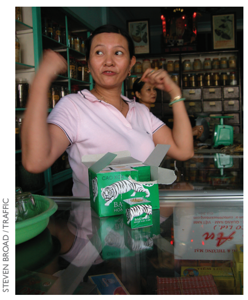
A shopkeeper in Hoi An, Viet Nam, explaining the power of Tigers in traditional medicine.

have a corollary in the "Value-Action Gap" (Kollmuss and Agyeman, 2002); i.e. a recognition that survey respondents often report caring about the planet and living a sustainable lifestyle to protect it, but do not then save an adequate amount of water, waste and energy to do so.